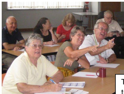
Train the trainer 2011