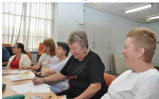
Buddies participating in Volunteer training