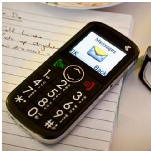
Telstra's EasyCall 2 phone for the elderly

Telstra has revealed a new phone which boasts a huge keyboard and bright screen with a focus on providing a unique and easy to use experience for seniors.