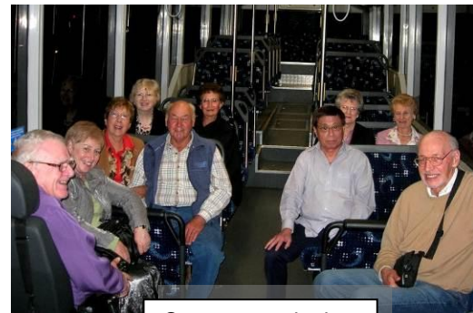
Our crew on the bus

On Monday 19 th September, 11 members parked at Marist High School at Westmead, ready to join a group of schoolboys and their teachers for a trip into the ABC Studios at Ultimo.